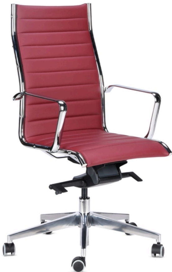
THE PHOTO MAY INCLUDE OPTIONAL